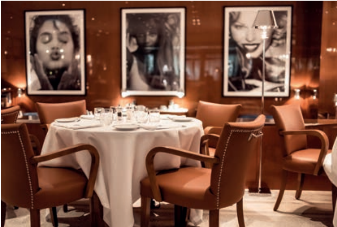
Cipriani Dubai, United Arab Emirates