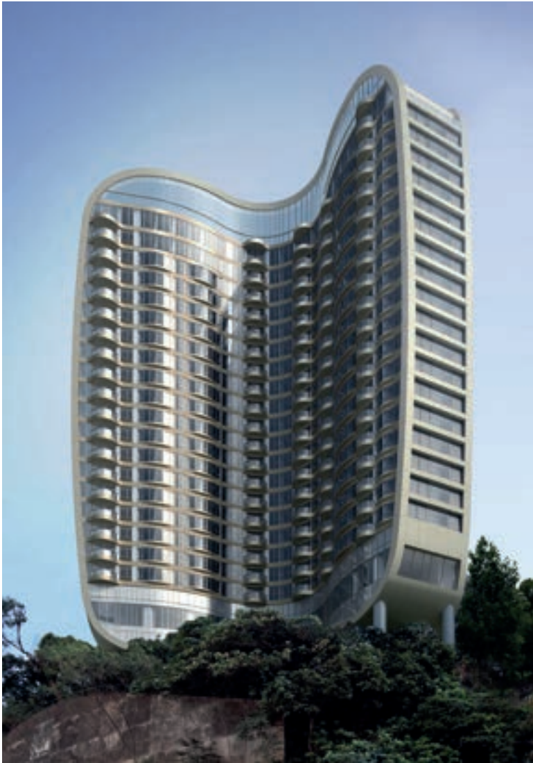
Mount Parker Residences, Hong Kong China