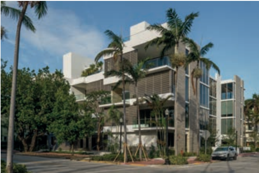
Louver House, Miami USA