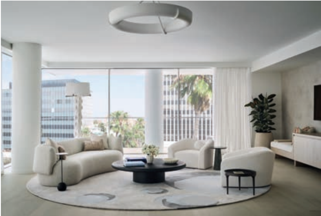
Mandarin Oriental Beverly Hills, Los Angeles USA