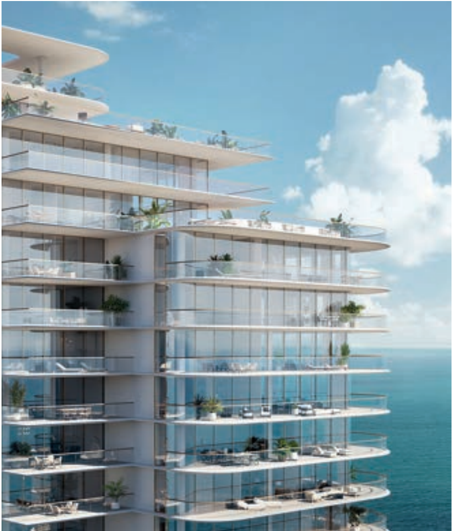
The Perigon, Miami USA