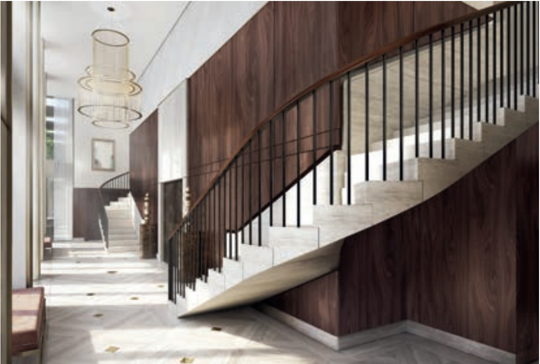
Chelsea Barracks, London England