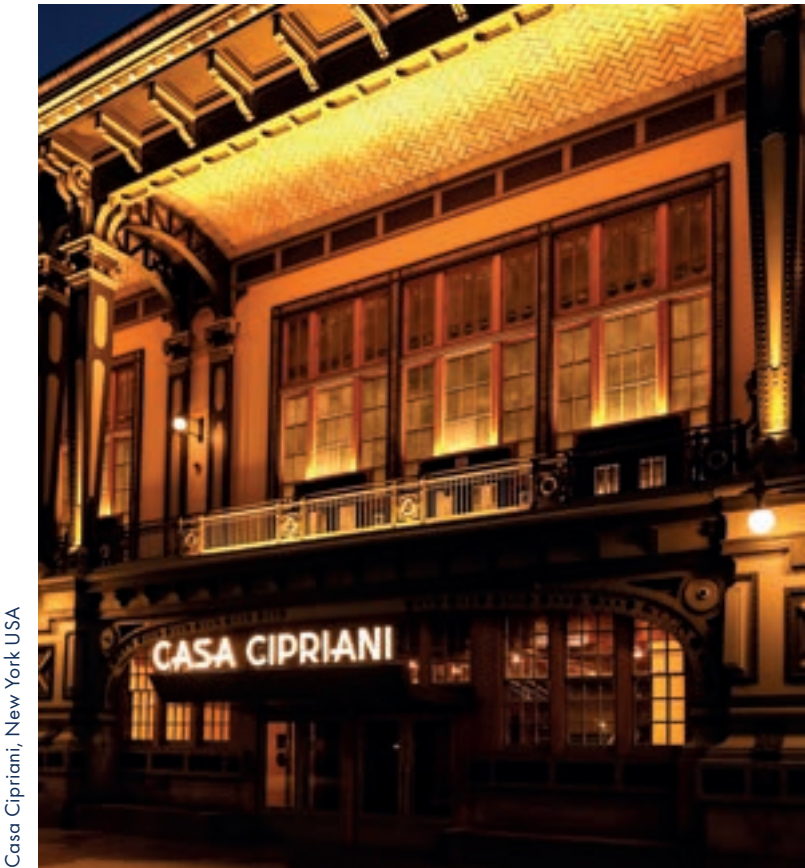
Casa Cipriani, New York USA